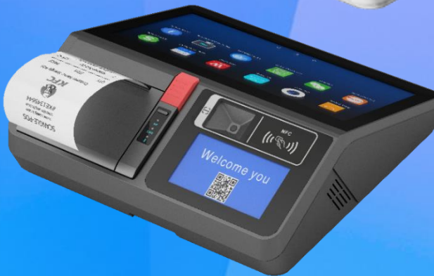
with 4.3" TFT LCD Second Display